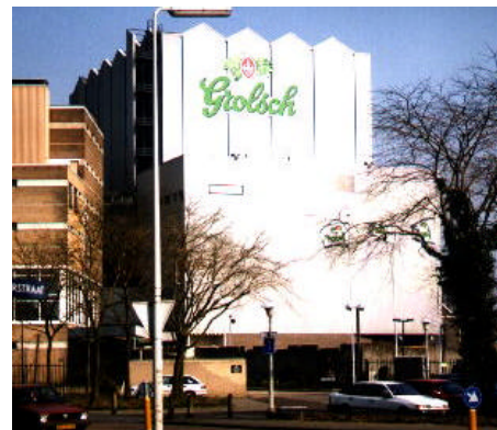
Grolsch Brewery The Netherlands

Before the BioTector® on-line TOC analyser was installed in the Grolsch brewery, extensive testing was carried out to verify that the instrument was suitable for the brewery application. An essential criteria was that the BioTector® should demonstrate good correlation to laboratory COD analysis results. Test results gave a correlation coefficient of 0.94 - which was more than good enough for translating BioTector® TOC data into COD values. (See correlation graph on following page.)